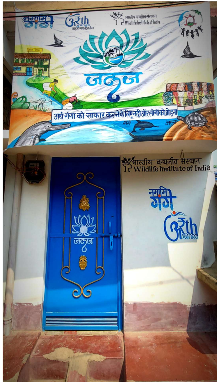
1. Tikuli and Mithila Art Center at Jalaj Ashoka in Patna Saheb, Bihar