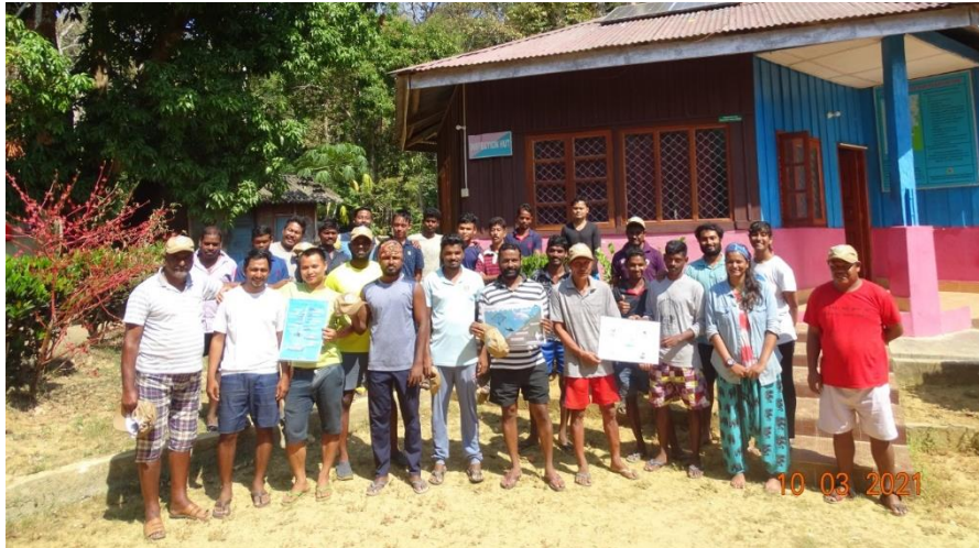
Capacity building program with frontline forest staff and police staff posted at Interview Island