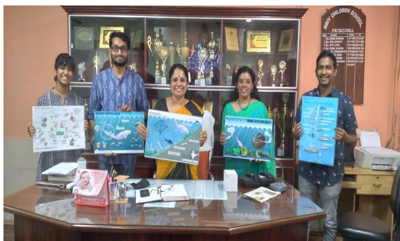
22 nd January 2021: We conducted a sensitization program with the Grade 11 kids of the Navy Children School, Port Blair, and sensitized the kids about their state animal DUGONG.