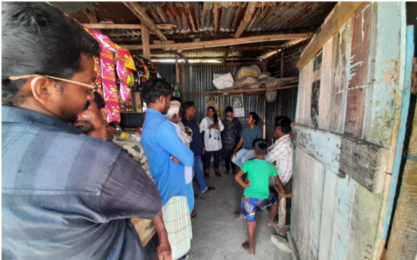
20 th March 2022: Community awareness program with fishers Mayabunder Fishing Colony