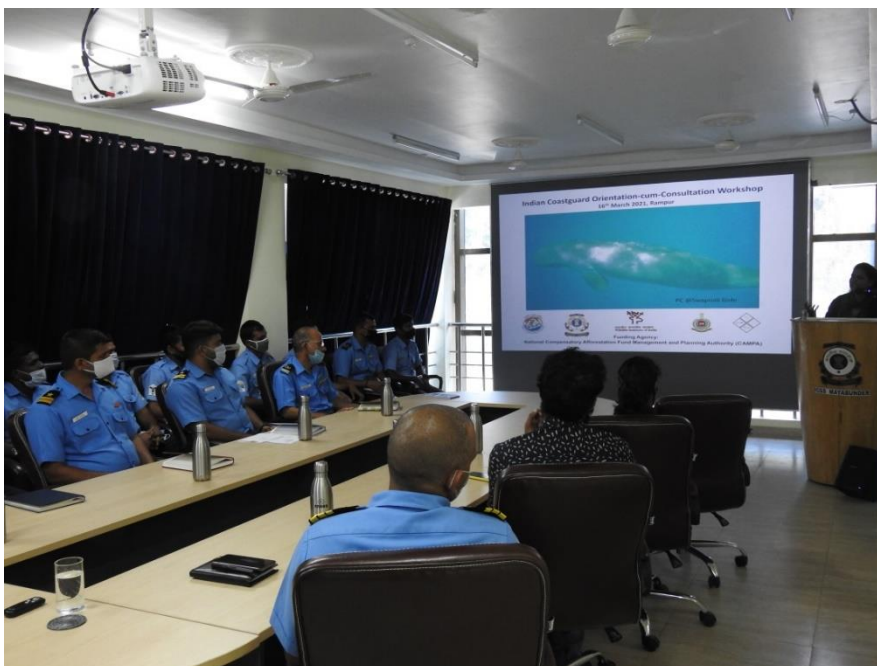
Capacity building program conducted with Indian Coastguard, Rampur.