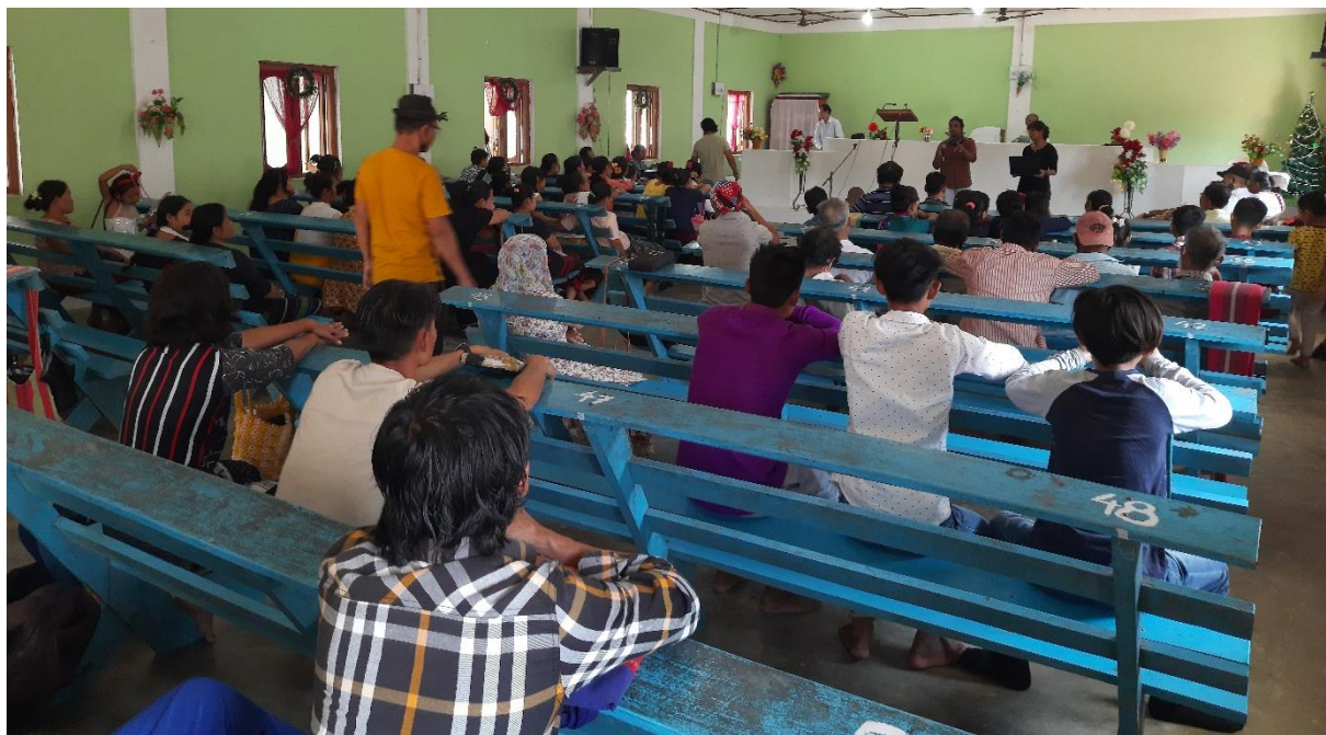
28 th February 2022: Mass sensitization and community interaction, Karmatang