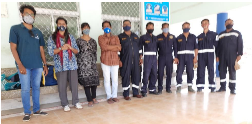
Capacity building program conducted with Marine Police