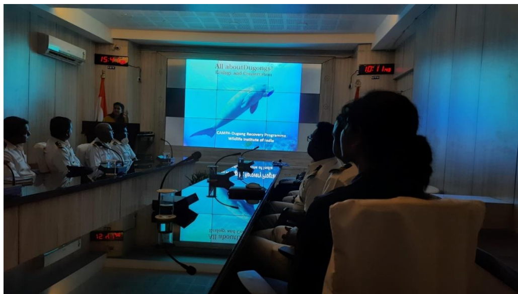
Dugong sensitization programs with Indian Navy (INS Utkrosh, above) and ICGS Port Blair (Below).