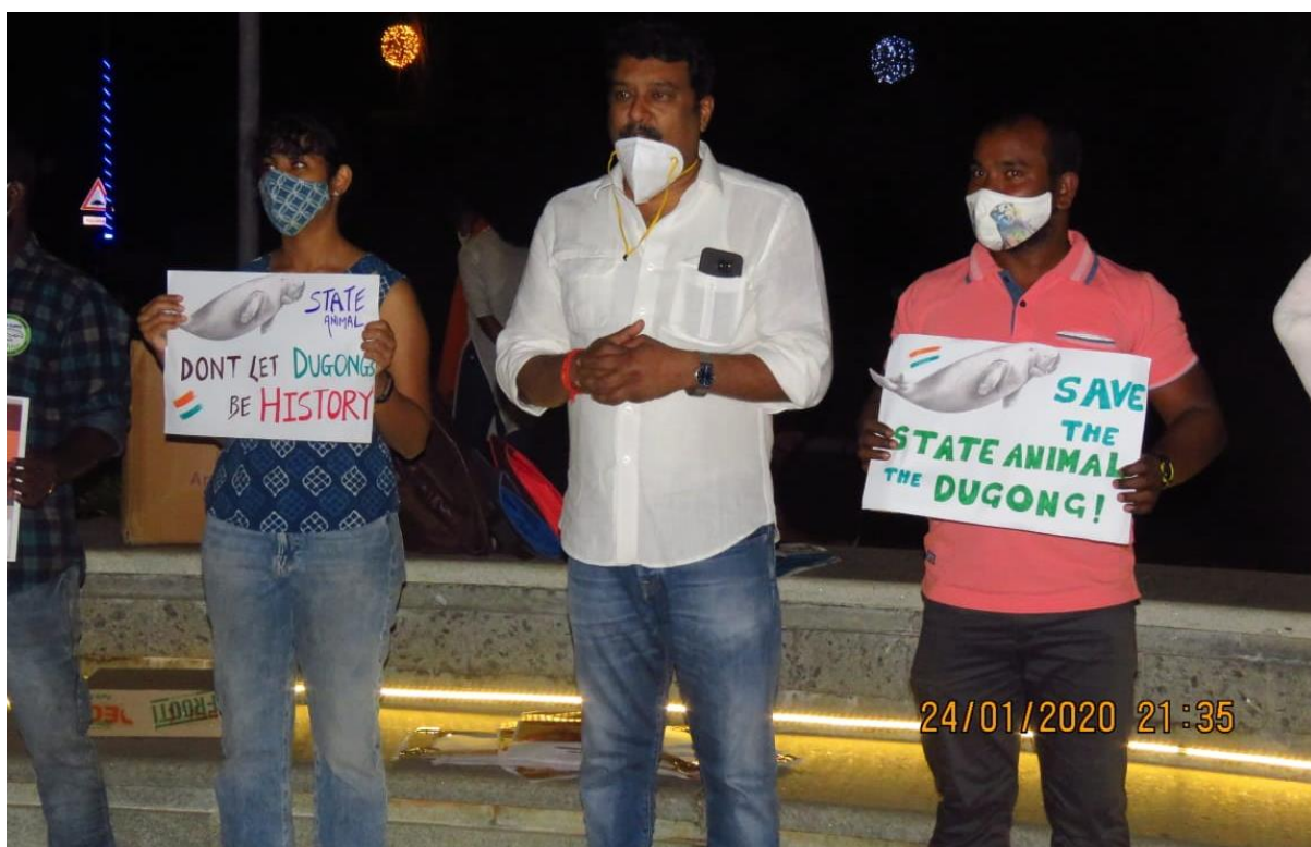
Mass sensitization through dugong awareness program conducted at Flag Point, Marina Park. The Member of Parliament of the Andaman and Nicobar Islands, Sh. Kuldeep Rai Sharma, addressing the crowd at Flag point, Port Blair, urging the masses to save dugongs!