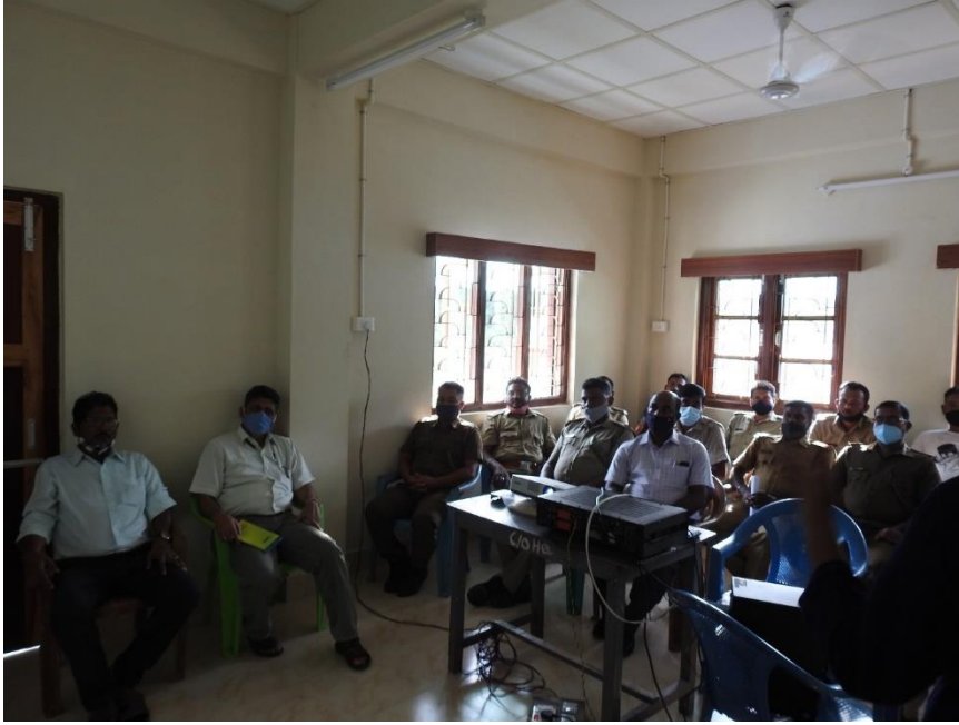
12 th February 2022: One day orientation program on' Dugong awareness, stranding response and dugong monitoring program' with Little Andaman Forest Division