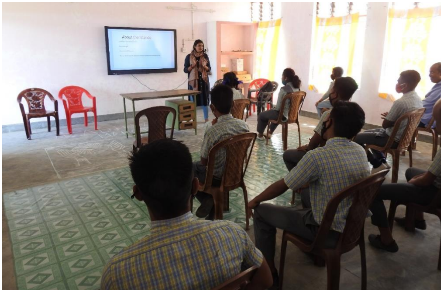
20 th January 2022: One day dugong sensitization program with Government Senior Secondary School, Harminster Bay, Little Andaman