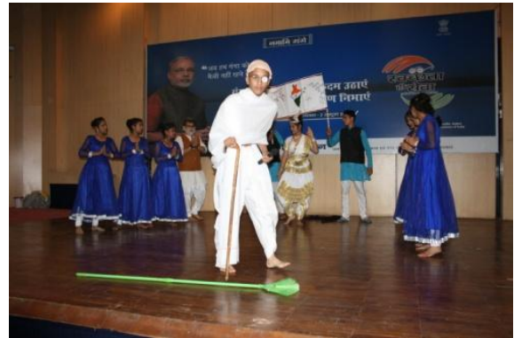
Group Dance on the theme "Swachhta and Namami Gange"