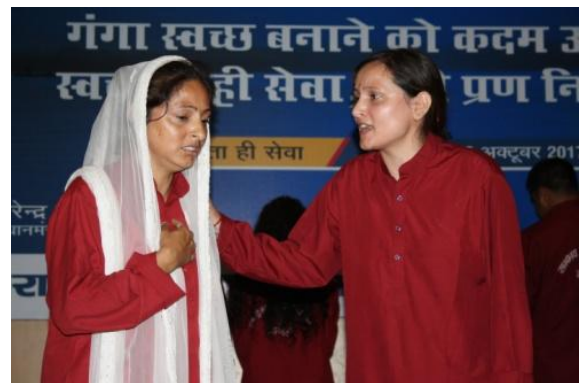
Nukkad Natak - "Jaggo" (Sambhav Manch Parivar)