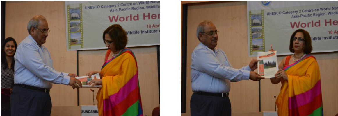
Picture 3. Launch of UNESCO E-bulletin

Bulletin” on the occasion of World Heritage Day, 18 April, 2015. This will be an E-Bulletin with a quarterly frequency. The Bulletin is a compilation of information on natural sites in the Asia-Pacific with a view to disseminate news and reach out to the wider natural heritage community. The information is based on free and publicly available sources.