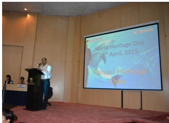
Picture 2. Quiz session