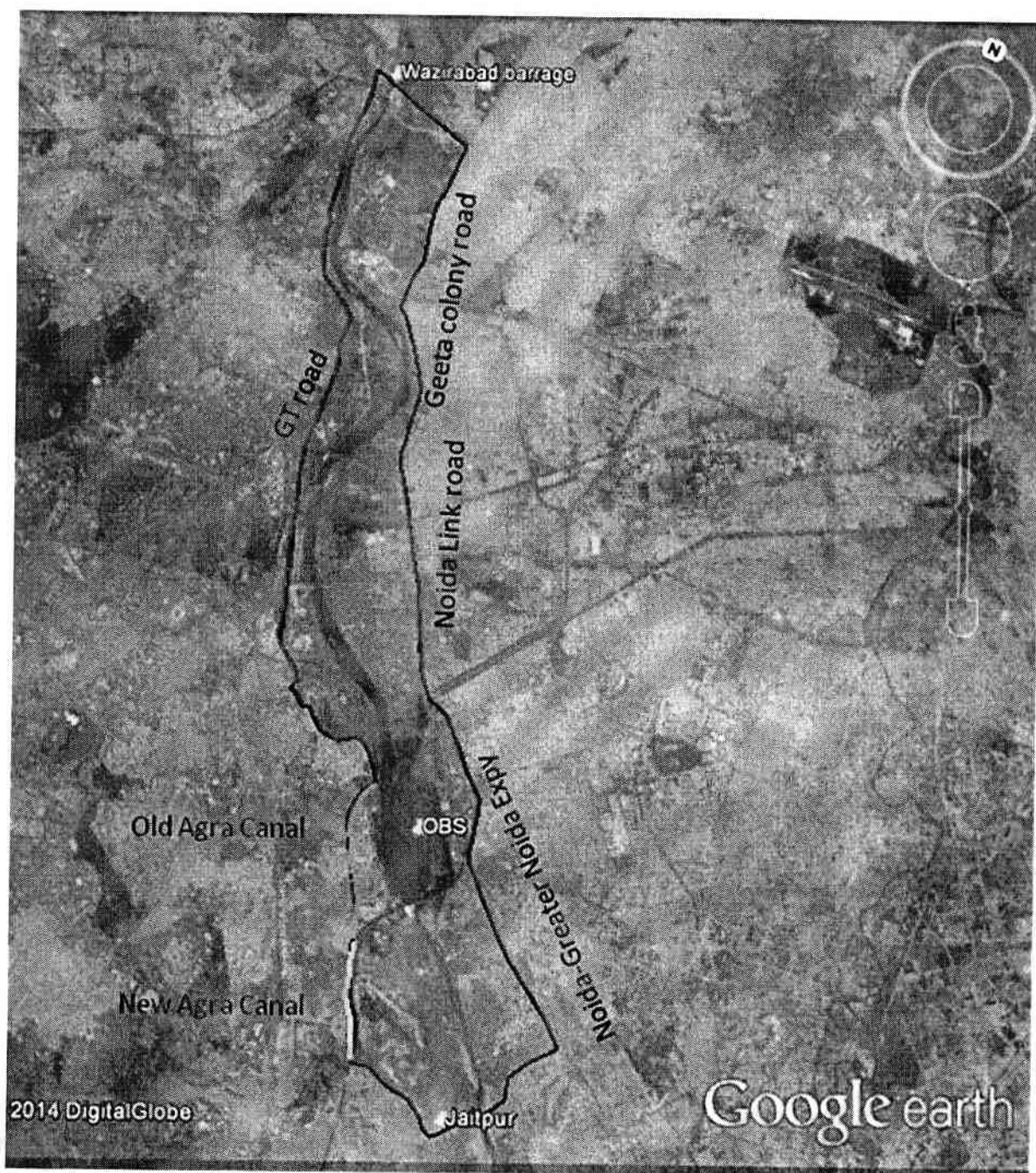
Suggested eco-sensitive zones of Okhla Bird Sanctuary, NCR Delhi