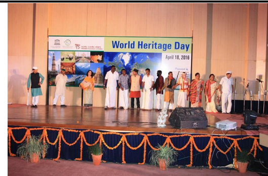
Faculty Heritage Walk representing Natural World Heritage Sites