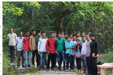
Students on Nature Trail