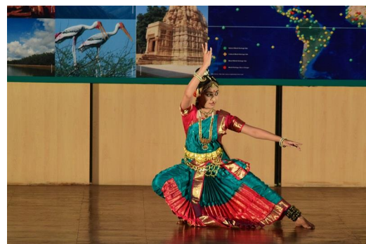
Kuchipudi dance by WII Researcher