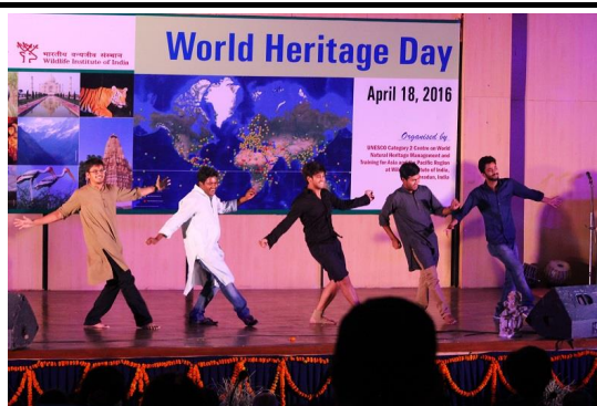
Dance performance by M.Sc. Students