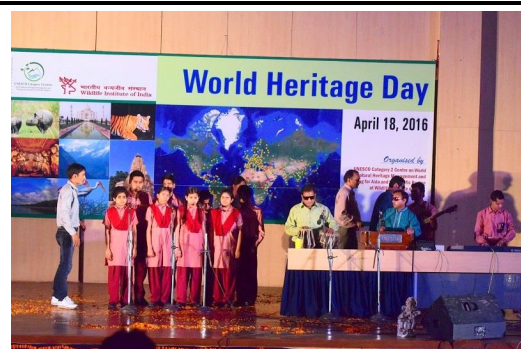
Songs by NIVH Students