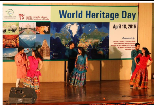
Dance by UNESCO C2C staff