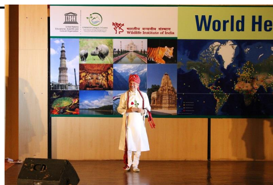
Performance by Director WII