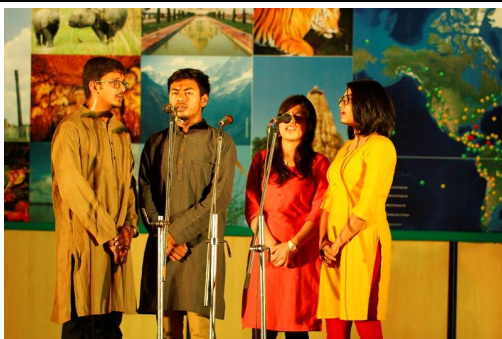
Medley by M.Sc. Students