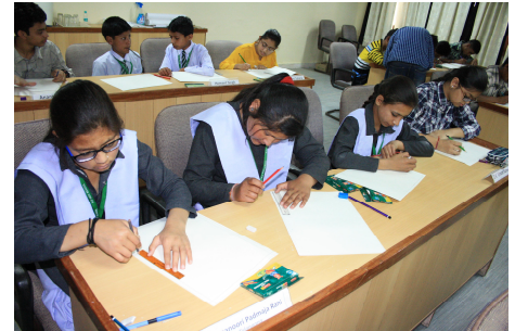
Students participating in Drawing and Painting competition