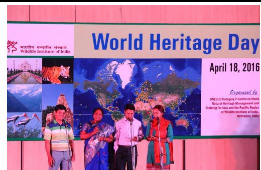
Songs by Diploma Officer Trainees