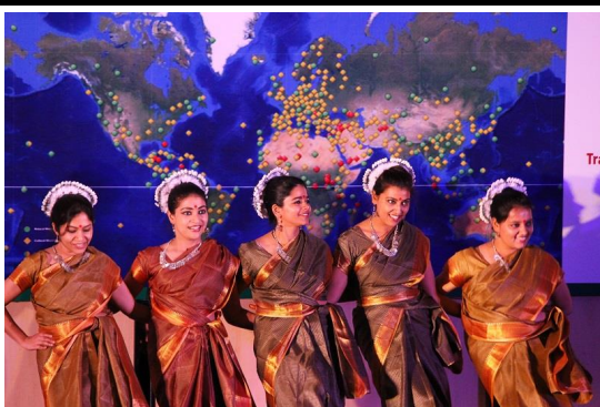
West Bengal Folk Dance