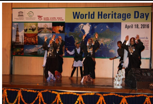
Folk dance by Nanda Devi School Students